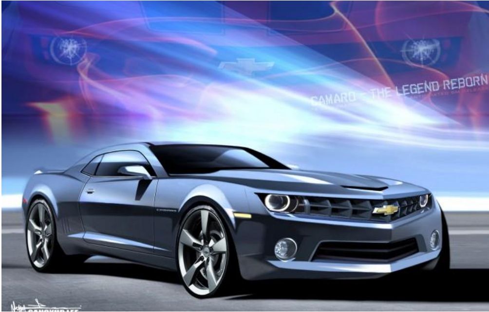
2010 CAMARO – GM DESIGN CONCEPT DRAWING