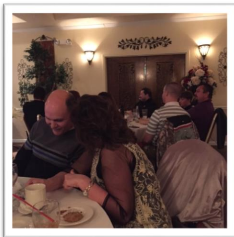
The Team Trivia Challenge had everyone, even the experts, sweating.